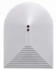
Glass break sensor, high false alarm immunity, tamper