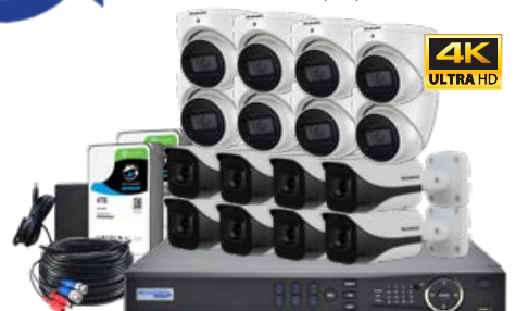
CVRKIT-P1688F (16CH DVR, 8TB HDD)