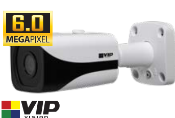
Pro 6.0MP Fixed IP Mini Bullet

6.0MP@20fps, 2.8mm (98°) lens, 40m IR, IVS incl. face detect, true WDR (120dB), microSD, ePoE, IP67