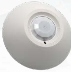
360° N.C./N.O PIR sensor, Ø8m range (at 4.5m height)