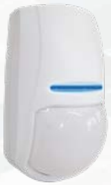
15m PIR sensor, dual pyro, tamper, N.C. incl. brackets