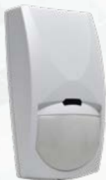
15m PIR/microwave sensor, N.C. tamper, wall mount