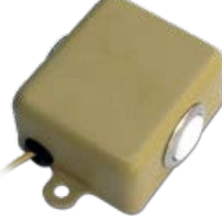
Dual button duress switch, N.O contact, rated 1A@25VDC