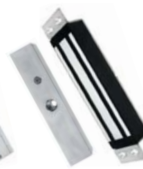
MAGLOC100M (Mortise mount)

¹ Free Reader applies to ACCON-2P models only. Free reader offer models include ACRDR-2SKC, or models of equal or lesser value.