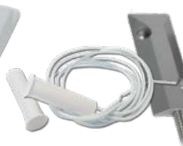
Concealed N.C./N.O wired reed switch (white)