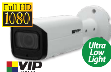
Pro 2.0MP Fixed IK10 IP Bullet

2.0MP@50fps, 3.6mm lens (87°), 60m IR, IVS, true WDR, microSD, ePoE, alarm I/O, audio I/O, IP67/IK10