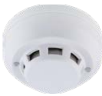
Photoelectric wired smoke sensor, 20m² range, 4-wire relay