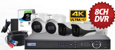
CVRKIT-P482F (8CH DVR, 2TB HDD)