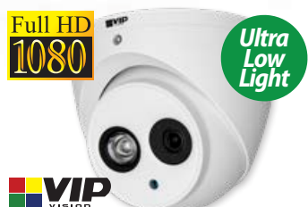
Pro 2.0MP Fixed IP Turret

Pro IP Camera Series Up to 8.0MP | Video Analytics | Fixed & Motorised Lens