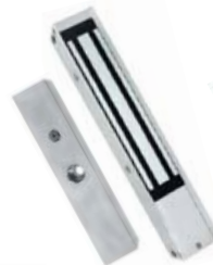
MAGLOC100S (Surface mount)