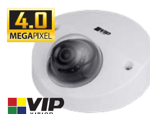
Pro 4.0MP Fixed IP Wedge

4.0MP@25fps, 2.8mm (104°), 3.6mm (87°), 6.0mm (57°), 20m IR, IVS, true WDR, microSD, built-in mic, IP67/IK10