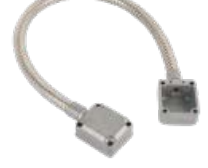
Surface door loop, stainless steel tube, metal (600mm)