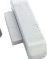
Supervised wireless reed switch for 864 panel, 100m LoS