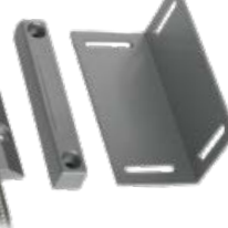
Heavy duty roller shutter door N.C wired reed switch