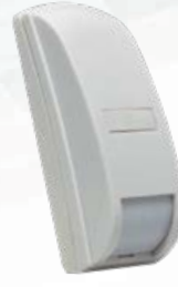
6m curtain PIR sensor, dual pyro, N.C. tamper