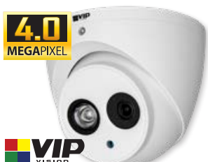
Pro 4.0MP Fixed IP Turret

4.0MP@25fps, 2.8mm (104°), 3.6mm (87°), 50m IR, IVS incl. face detect, true WDR, built-in mic, microSD, ePoE, IP67