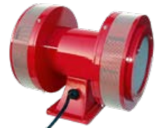
130dB, single tone, 240VAC, IP44 warning siren