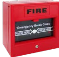
Emergency door release, N.O/N.C. flush/surface, 24VDC