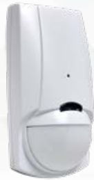
15m PIR + glass/shock sensor, N.C. 10m glass break dist.