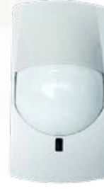
Supervised wireless reed PIR for 864 panel, 12m range