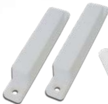
Large ROLA style N.C wired reed switch