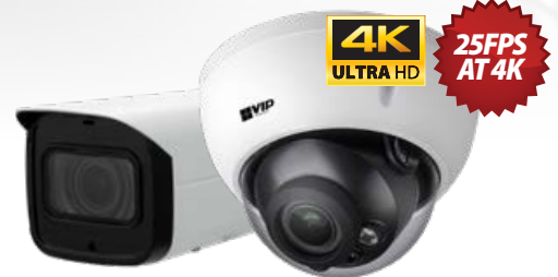
VSIP8MPFBIRMD / VSIP8MPVDIRMD

8.0MP@25fps, 3.7~11mm (112°~46°) lens, intrusion/tripwire IVS, up to 60m IR, true WDR, IP67 (+IK10 dome)