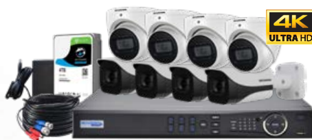
CVRKIT-P884F (8CH DVR, 4TB HDD)