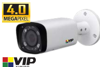
Pro 4.0MP Motorised IP Bullet

4.0MP@20fps, 2.7~13.5mm motorised lens (104~28°), fixed iris, 60m IR, true WDR (120dB), IP67