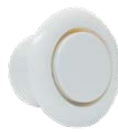
Surface & Flush mount internal sirens (110dB)