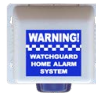
Complete outdoor siren, AC/DC 115dB siren, tamper, strobe