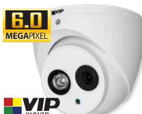
Pro 6.0MP Fixed IP Turret

6.0MP@20fps, 2.8mm (98°), 3.6mm (69°), 50m IR, IVS incl. face detect, true WDR, built-in mic, microSD, ePoE, IP67