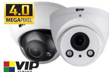
Pro 4.0MP Motorised IP Dome

4.0MP@20fps, 2.7~13.5mm motorised lens (104~28°), fixed iris, 30m IR (50m turret), true WDR, IP67 (IK10 model)