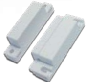
Compact white N.C wired reed switch