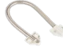
Surface door loop, stainless steel tube, plastic (400mm)