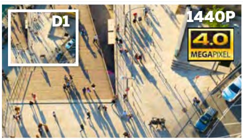
Up to 9x Image Resolution vs D1