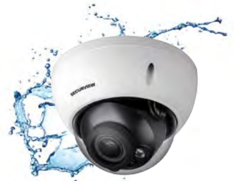
Weather & Vandal Resistant