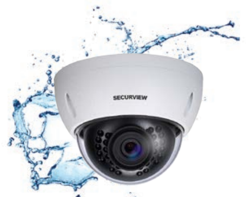
Weather & Vandal Resistant