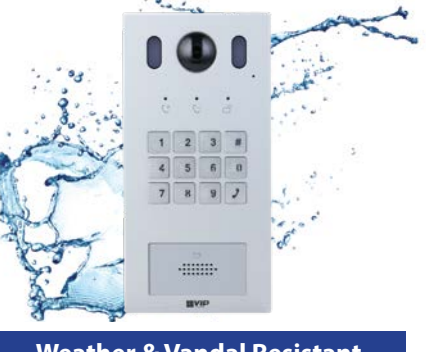
Weather & Vandal Resistant