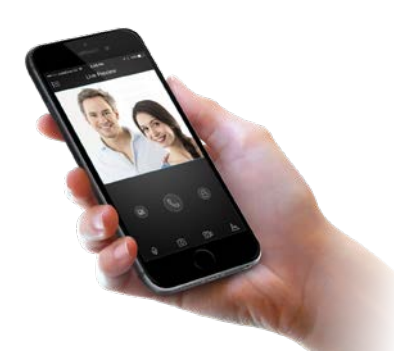
Remote Unlock & Answer via App