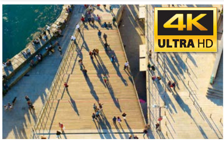
Record up to 4K in Real Time (25fps)