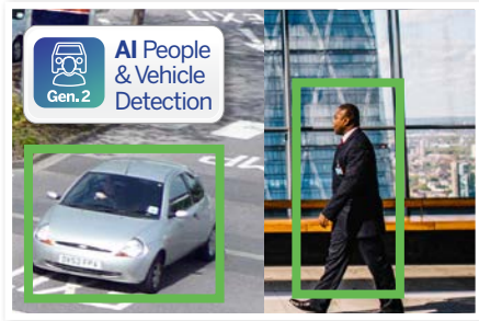
Smart Person & Vehicle Detection