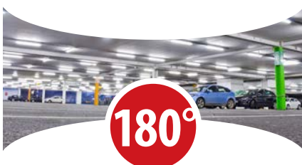
180° Coverage Surveillance