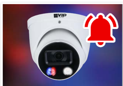
Spotlight, Siren & Blue/Red Strobe