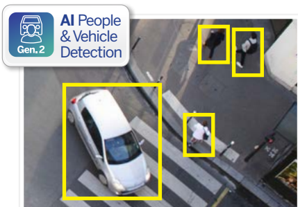
AI Human & Vehicle Detection