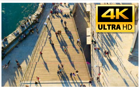
Record up to 4K in Real Time