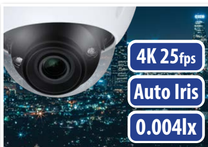
Superb Image Performance