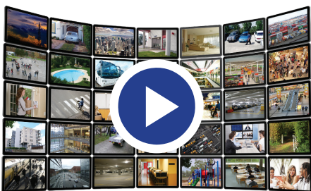
Large Scale Surveillance Management