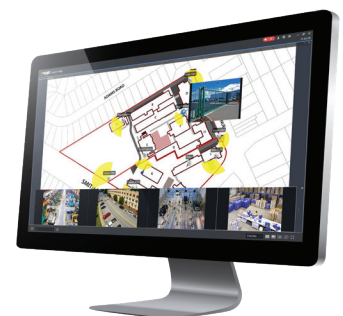
Visualise System with Emap