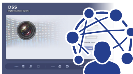
Powerful User Management