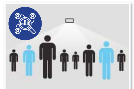
People Counting & Flow Control