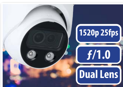
Superb Image Performance