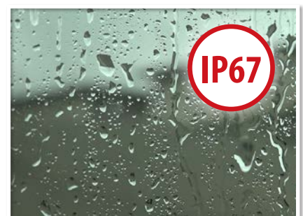
Great Weather Resistance