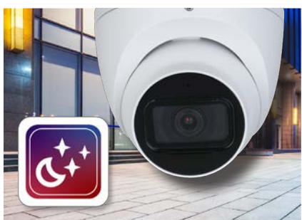
Starlight Low Light Performance