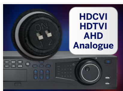
Switch Camera to Suit DVR