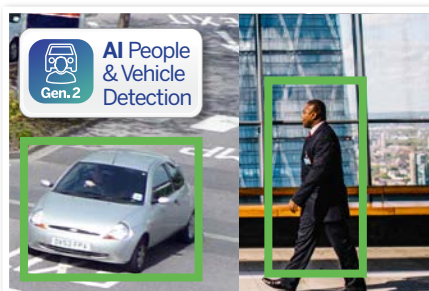
Smart Person & Vehicle Detection