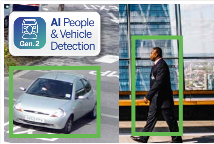
Smart Person & Vehicle Detection