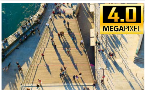
Record 4.0MP in Real Time (25fps)