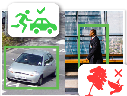
AI Person & Vehicle Detection