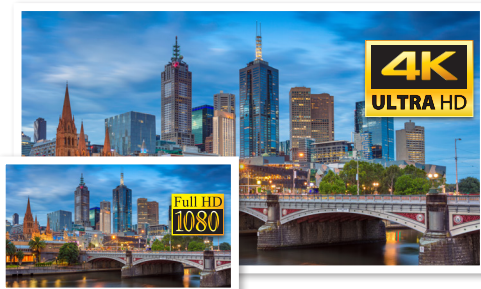
Ultra HD Recording Over Coax

**IP cameras with built-in AI cannot use AI functions on HDCVI DVRs.