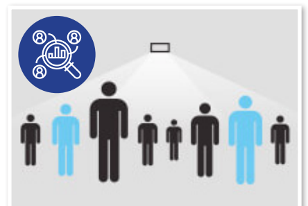
People Counting & Flow Control