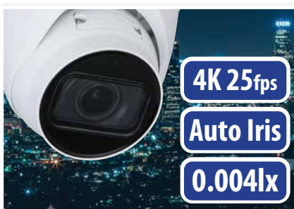
Superb Image Performance