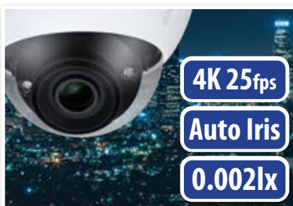
Superb Image Performance