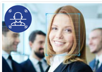
AI-Enhanced Face Detection