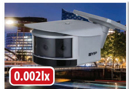
Superb Low Light Performance