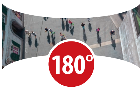
180° Panoramic View & Infrared