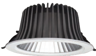
Dimmable WiFi Downlight Model: LDW-S20