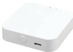
WiFi Sig-Mesh Gateway Model: LDW-S-WI