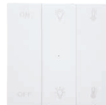
WiFi Wall Switch Model: LDW-S-SW