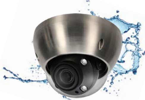
Protection from Rust and Corrosion