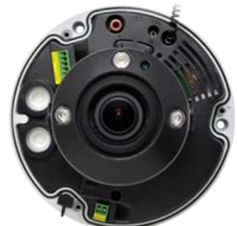
Unrivalled Camera Functionality