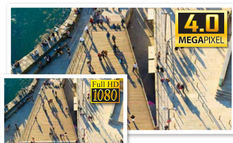
Record at 4K Ultra HD Resolution