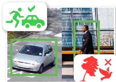
Smart Person & Vehicle Detection