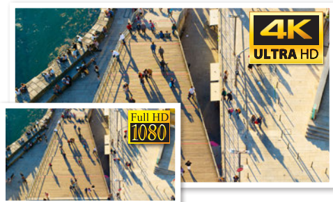
Record at 4K Ultra HD Resolution