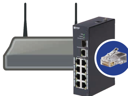
Connect & power over Ethernet