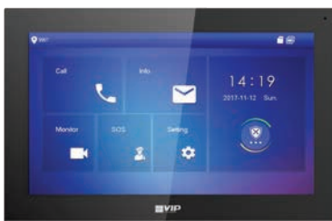
10" Slimline Touchscreen Monitor