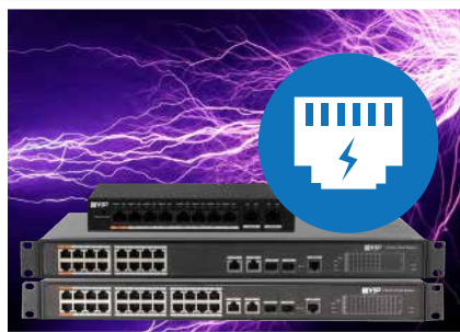
PoE+ and Hi-PoE Support