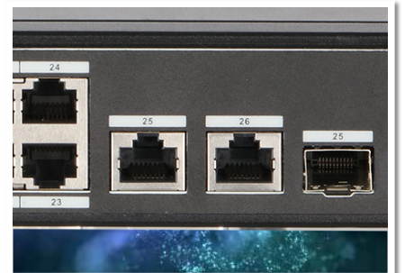
Gigabit (1000M) Uplink Ports