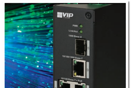
Gigabit RJ45 & SFP Uplink Ports