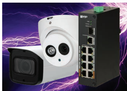
Supports up to 60W Hi-PoE Per Port