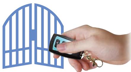
Activate Gates & Other Systems