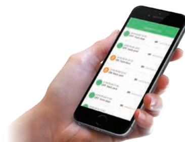
App Control & Configuration