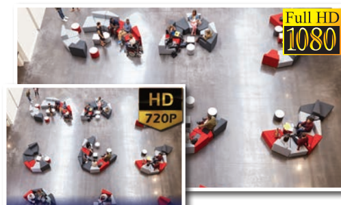
Full HD Recording Over Coax