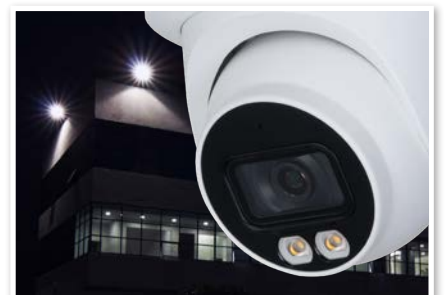
Manual LED Light Control