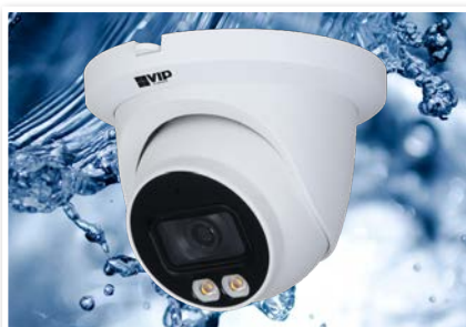
Weather Resistant Housing