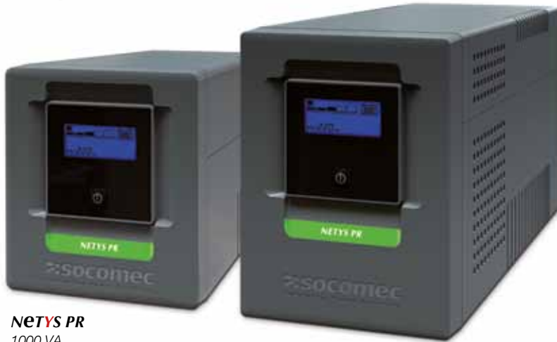
NETYS PR 1000 VA