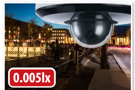
Superb Low Light Performance