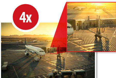
Up to 4x Optical Zoom