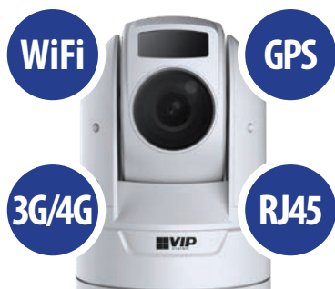
Flexible Networking Formats