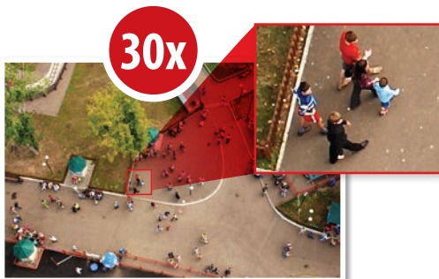
Up to 30x Lossless Optical Zoom