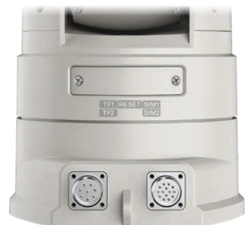
Heavy-Duty Aviation Cables