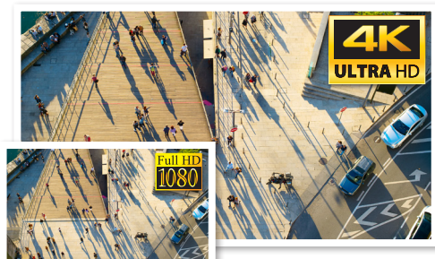
Stream Ultra HD over coax