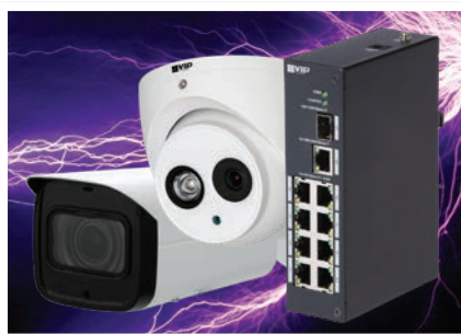
Supports up to 30W PoE+ Per Port