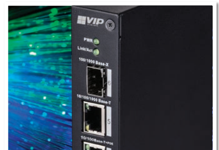
Gigabit RJ45 & SFP Uplink Ports