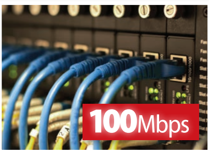
Fast 100Mbps PoE+ Device Ports