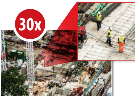
30x Lossless Optical Zoom