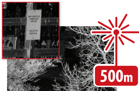
Precision Laser Infrared System