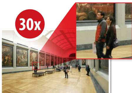
Up to 30x Lossless Optical Zoom