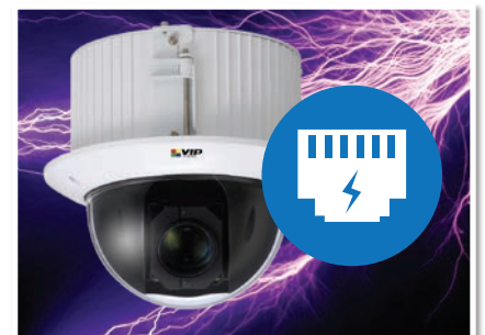
Power via PoE+ (802.3at)