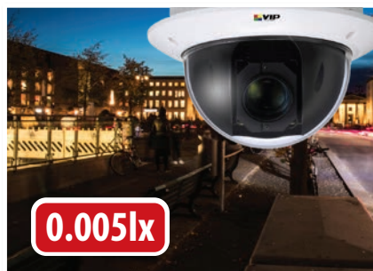
Superb Low Light Performance