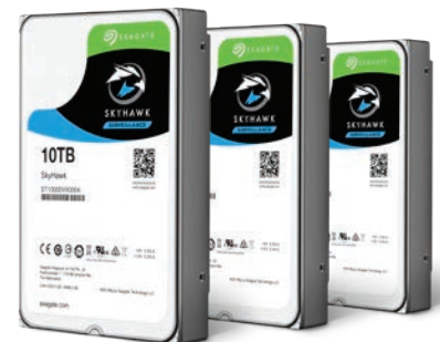
Versatile Storage & Backup