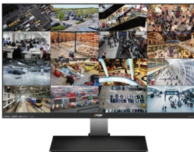
Expand up to 128 IP Cameras