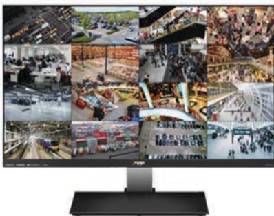
Expand up to 64 IP Cameras