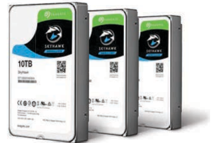
Versatile Storage & Backup