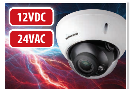
Dual Voltage Compatible