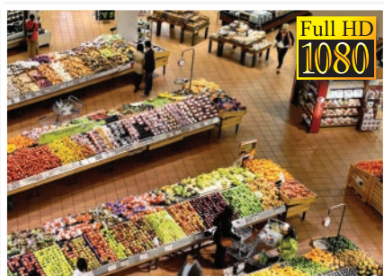
Live 1080p Camera Stream Display