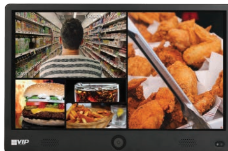
Configurable Signage Display