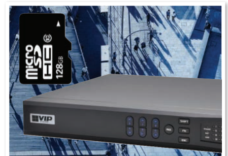
Recording via microSD or NVR