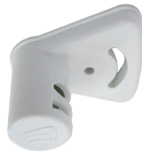
Ceiling Mount Bracket