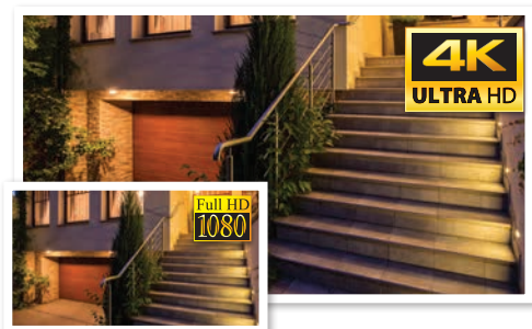
Ultra HD Recording Over Coax