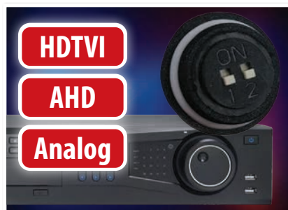
DVR Cross Compatibility