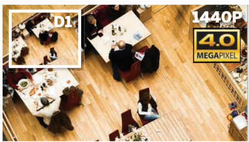
Up to 9x Image Resolution vs D1