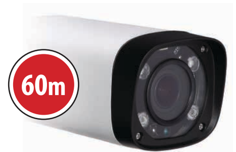
60m Long Range Infrared