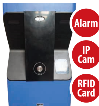
Versatile Security System Integration