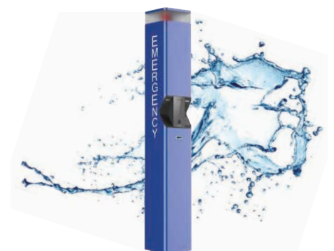
Weather & Vandal Resistance