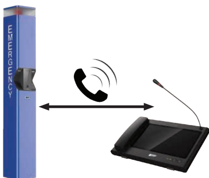
Two-Way Audio Talk with 1 Push