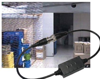
Remove Ground Loop Interference