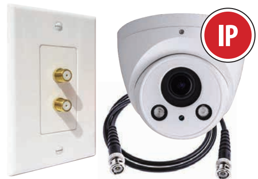
Use Existing Coaxial for IP Installations