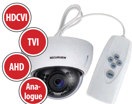
Test, Check & Change Video Output