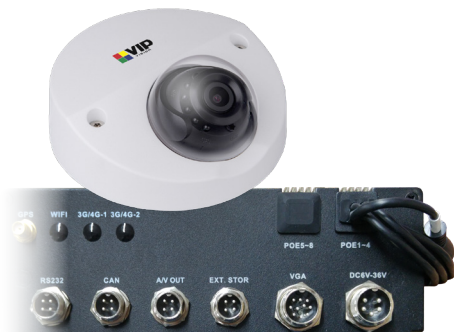
Liveview for MCVRs/MDVRs