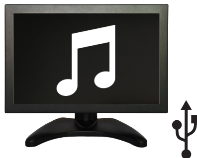
Play Music & Video Files via USB