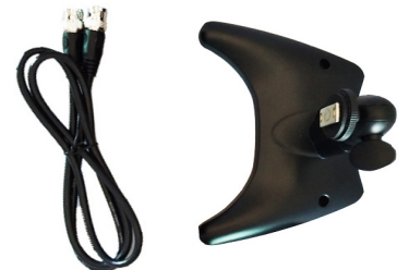
Complete Accessory Kit