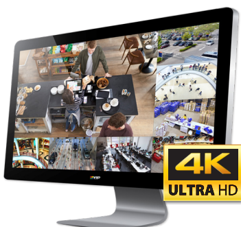
4K/Ultra HD Live View + 2CH Record