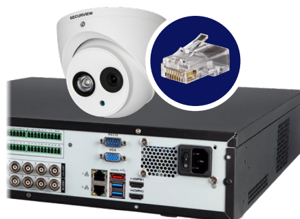
Add up to 64 IP video inputs