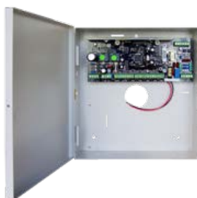
WGAP864 Alarm Panel

These versatile relays modules are compatible with other Watchguard™ products.