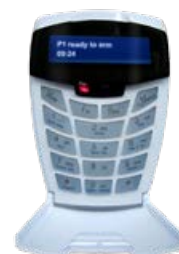
WGAP864KP LCD Keypad

Use the RLM7A-SDL2 Breakaway 10-pack Module with the alarm panel to greatly expand the number of relays available for the system.