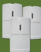
3 x High Quality PIR Sensors