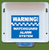
1 x Outdoor Siren/Strobe