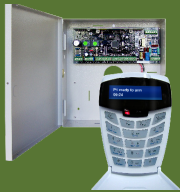
1 x 8 Zone Alarm Control Panel with LCD Keypad

If you're looking for complete home or commercial building protection, you NEED one of the Watchguard™ Complete Hardwired Alarm Systems. Available in both an 8 zone panel and a 16 zone panel, each kit also contains an internal and external siren, motion sensors, reed switches, emergency panic button and all necessary power supplies and cabling. These detectors and sirens help protect ALL areas of your home or building by performing functions such as monitoring rooms and offices for movement, and detecting when doors or windows are opened. This gives you greater peace of mind that your building is secured against thieves, burglars and vandals.