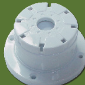
1 x Indoor "Top Hat" Piezo Siren