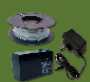
1 x 7Ah Lead Acid Backup Battery 1 x 100M of 4 Core Alarm Cable 1 x 16VAC Power Supply