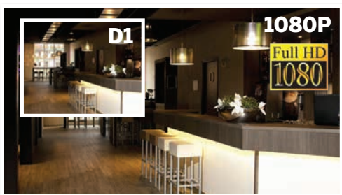
5x Greater Resolution vs D1