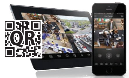
Remote View via QR Code