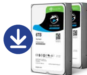
High Capacity Storage