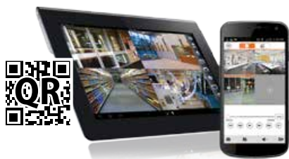
Remote View via QR Code